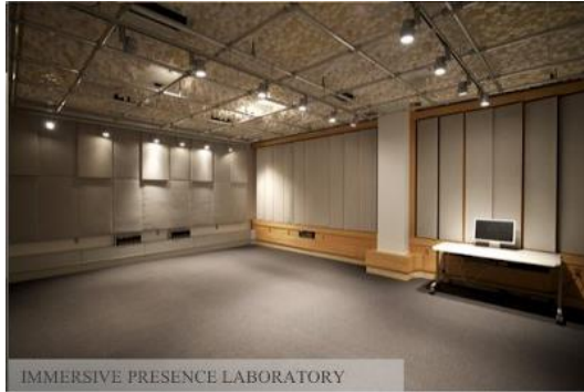
IMMERSIVE PRESENCE LABORATORY